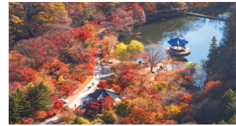
Mt. Naejang in Jeongeup