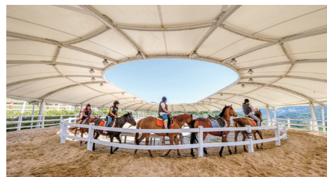
Jangsu Seungma Experience Market

Muju, located in central Jeonbuk, is a mountainous area blending natural beauty with clean environments. The Deogyusan National Park is a popular destination for skiing in winter and hiking in summer. Muju is also known for its fireflies, a symbol of the region's clean nature, and the National Taekwondo Center, a sacred site for Taekwondo practitioners.