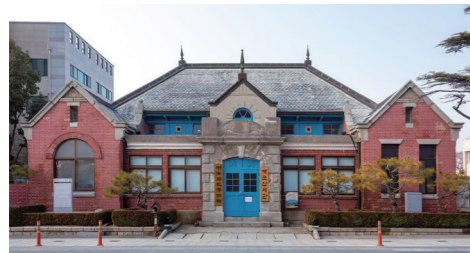
Gunsan Modern Cultural Heritage

Jeonju, with its thousand-year history, is the largest city in Jeonbuk and a UNESCO-designated City of Gastronomy. Known for its rich traditional culture, including Hanok (traditional Korean houses), Hanji (Korean paper), and Hanbok (traditional clothing), Jeonju attracts 10 million visitors each year, famous for its food and culture.