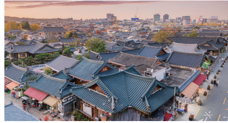
Jeonju Hanok Village