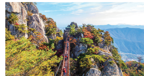
Daedunsan Mountain in Wanju

Gimje is a city of agriculture with a unique landscape where the earth and sky meet at the horizon. The Gimje Horizon Festival, held annually, celebrates Korean agricultural culture against the backdrop of endless fields and attracts both domestic and international tourists.