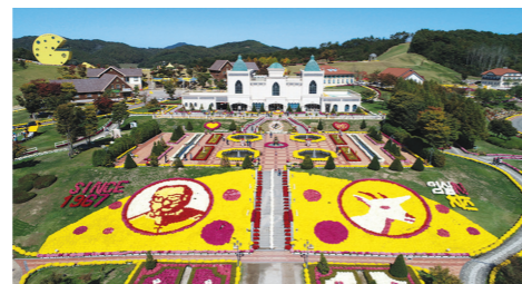
Imsil cheese theme park