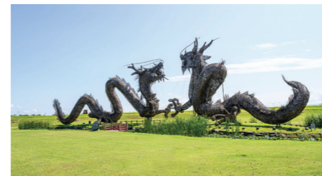
Kimje the horizon

Namwon is a cultural city known for a variety of festivals, such as the Chunhyang Festival and Heungbu Festival. The city served as the backdrop for the Pansori (traditional Korean music) Chunhyangjeon. Namwon is like a roofless museum, offering richer cultural resources than any other region, as visitors can experience the culture of their ancestors at every turn, including the Jirisan Dulle-gil trail and the Dongpyeonje of pansori.