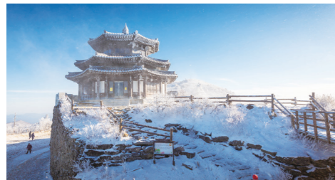
Muju Deoksan National Park

Jinan is the land of life, embracing Maisan Mountain and boasting pristine nature. As Jinan's symbolic landmark, Maisan Mountain, with its unique ear-shaped peaks, offers breathtaking views year-round. Jinan's red ginseng, renowned for its medicinal properties, is widely recognized for its high quality.