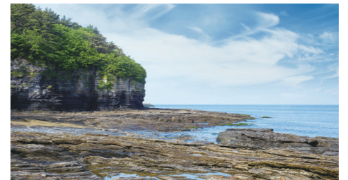
Buan Quarry Steel

Sunchang is renowned as the birthplace of traditional fermented foods in South Korea. The Sunchang Fermented Food Festival, held annually, offers visitors the opportunity to experience a variety of fermented products such as Gochujang (red pepper paste), Doenjang (soybean paste), and soy sauce. The area is also famous for its beautiful natural landscapes, with hiking and outdoor activities available in the pristine nature of places like Gangcheonsan Mountain and Bibongsan Mountain.