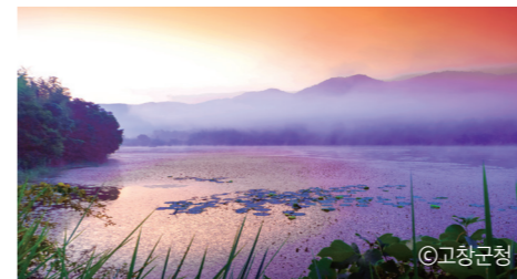
Gochang Ramsar wetlands

Imsil is where the history of Korean cheese began. As the important event widely acknowledging local specialties and culture, the Imsil Cheese Festival, famous worldwide, is becoming the famous site drawing lots of visitors. The area also boasts natural attractions like Okjeongho Lake, Deokchi Valley, and Seongsusan Mountain, making it an ideal destination for hiking and trekking.