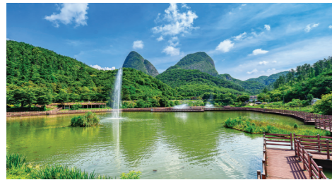
My Mountain in Jinan