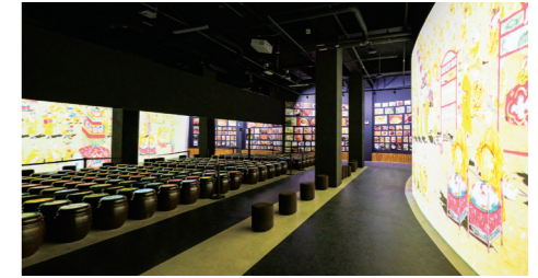
Sunchang Fermentation Theme Park

Gochang is an ecologically rich region in South Korea, to the extent that the entire administrative district is recognized as a UNESCO Biosphere Reserve for the first time in Korea. It is also a UNESCO World Heritage City, holding seven World Heritage sites. Gochang is home to natural heritage such as the ancient dolmens, tidal flats, and RAMSAR wetlands, as well as intangible cultural heritage like Pansori (traditional Korean storytelling music) and Nongak (Korean folk music and dance). It is a place where history and culture coexist, acknowledged by the world.