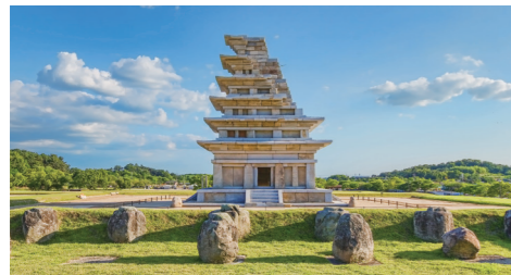
Iksan Mireuksa Temple Site Stone Pagoda

Gunsan, located on the west coast, is a port city and a key area in the Saemangeum reclamation project, the largest in the world. It leads the development of future industries centered on eco-friendly energy. The city also preserves modern historical sites, including those from the Japanese colonial period, earning recognition as a modern cultural heritage preservation area.